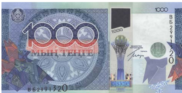
The new 1000 Tenge banknote with optically variable window (black in the picture)

The world's first banknote featuring Louisenthal's Moiré Magnifier feature.